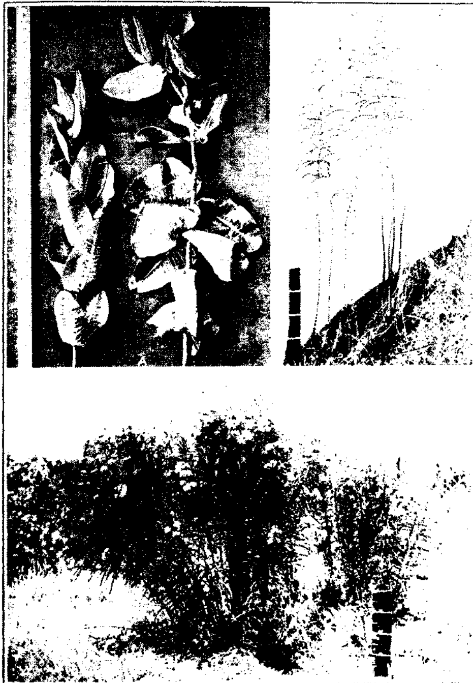
A. Juncifera sullivanti , collected at Lincoln, Nebraska.