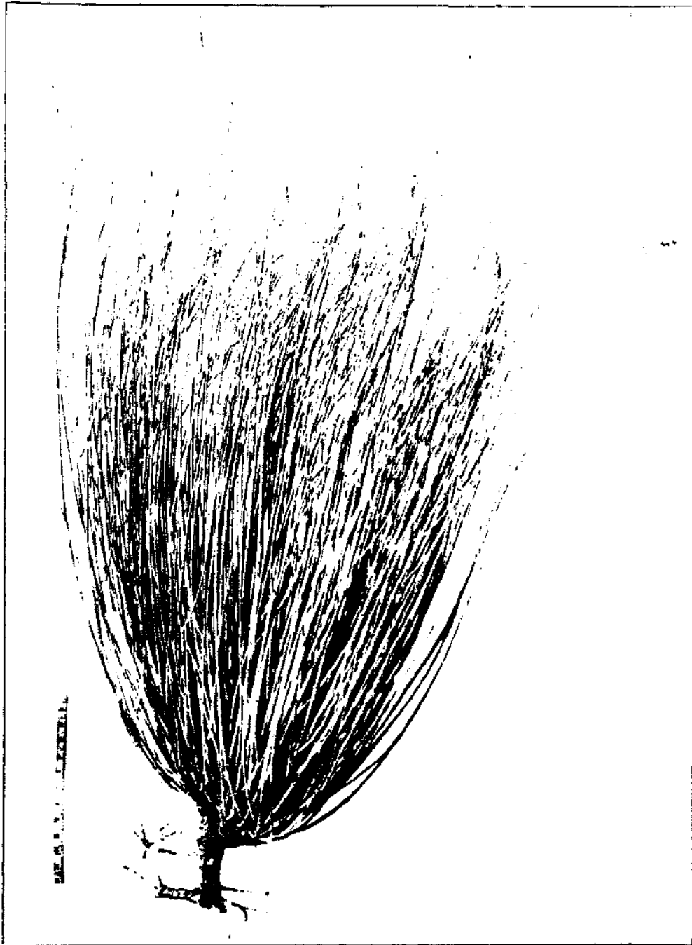
Asclepias aufrititoto , collected at Sentinel* Arisona. Plant 5 feet high.